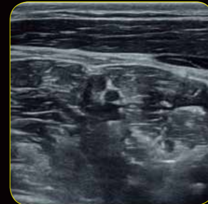
Exceptional near field detail clearly visualizes the brachial plexus nerve roots.