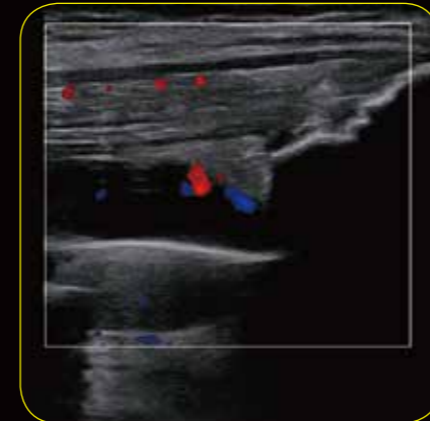
Highly sensitive color Doppler identifies low flow in this knee collection.