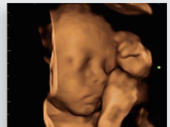
3D of Fetal Face