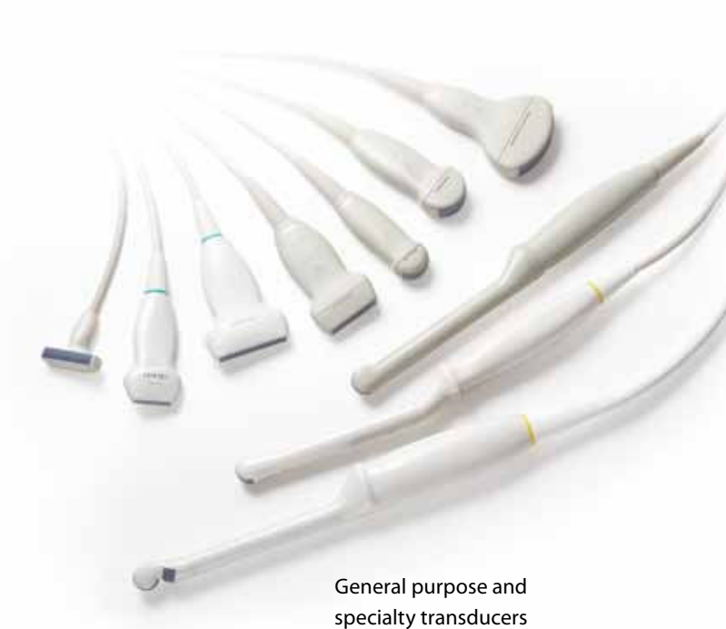
General purpose and specialty transducers