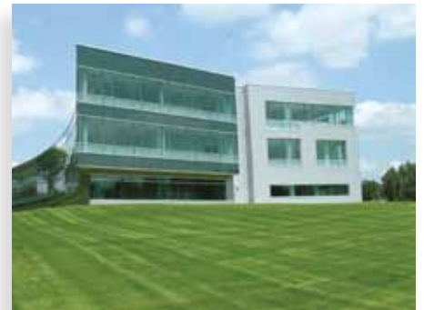
Mindray DS USA, Inc. U.S. headquarters in Mahwah, NJ

Learn how we can help you maximize your resources with some of the most advanced and affordable devices in the industry. For more information about Mindray products and services, visit www.na.mindray.com .